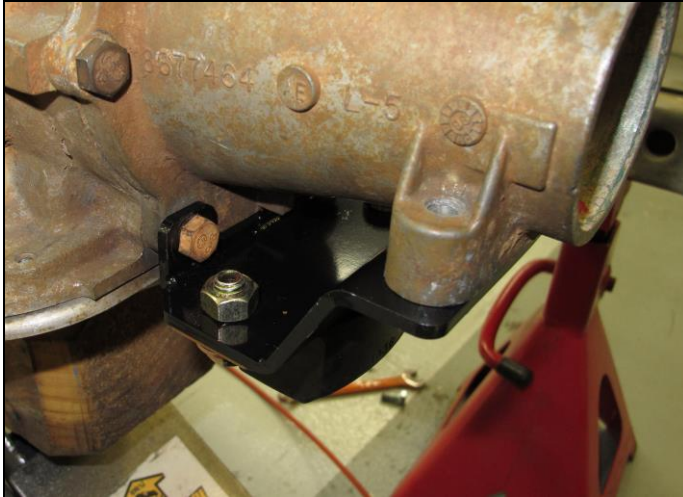
Figure 1 Mount compensation bracket attachment scheme

Attach bracket to transmission using the factory lower extension housing attachment bolts and the factory mount attachment bolts. Once completed, attach the transmission mount to the bottom of the compensation bracket with the supplied 7/16" bolts/nuts.